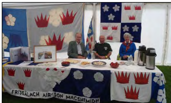
Clan Fraser of Lovat