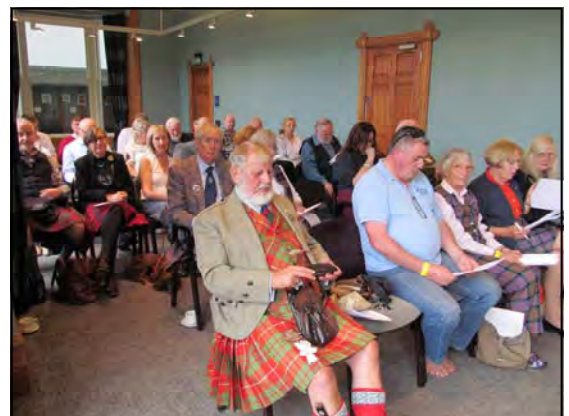
AHCS Members at the AGM

Did I actually act as Acting Secretary at all? It is a matter of debate. All I know is that we have a Secretary who is worth her weight in solid gold – be thankful it is not me! But .... if she does need some help again I would do it as the system she has in place works like a dream!