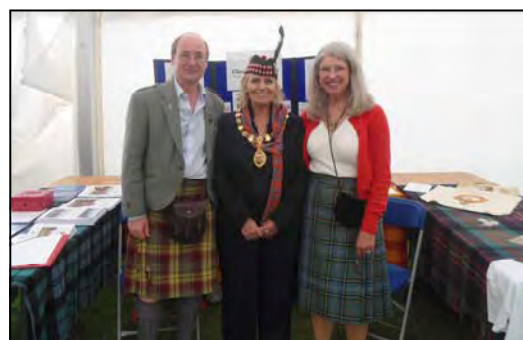
The Provost of Inverness touring the tables