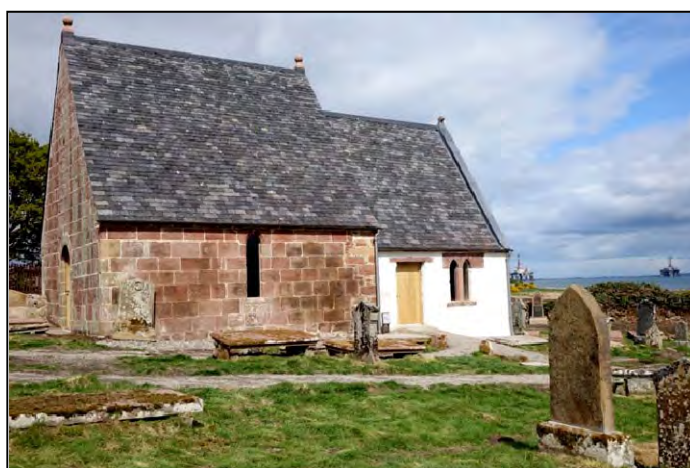
Kirkmichael: Building Work complete 2017

The Braelangwell estate located nearby was owned by the Davidson of Tulloch family for a period in the 19 th century.