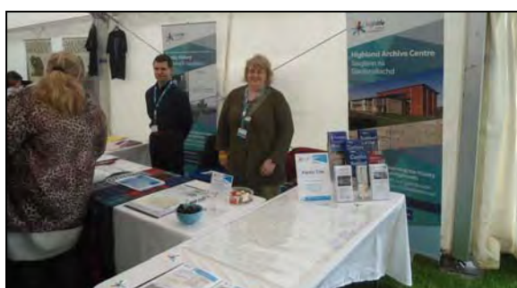
The Highland Archives