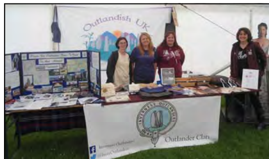
The Inverness Outlanders