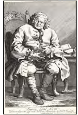
Hogarth's famous portrait of Lovat