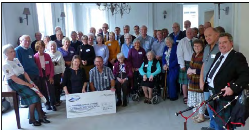
Charity Presentation at the Hexham AGM/Gathering