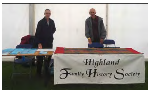
Highland Family History Society