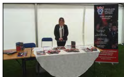
Highland Military Tattoo