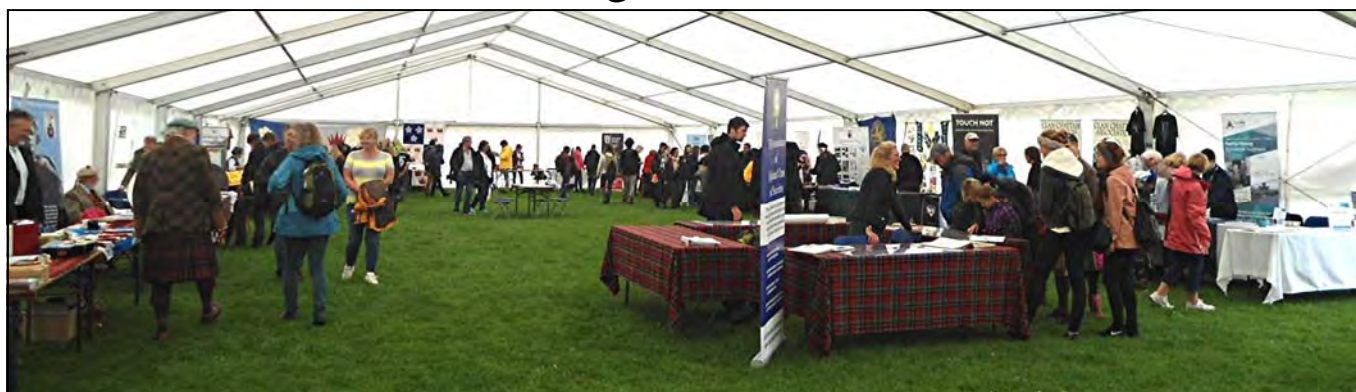
The Association Table in the centre of the Clans Tent