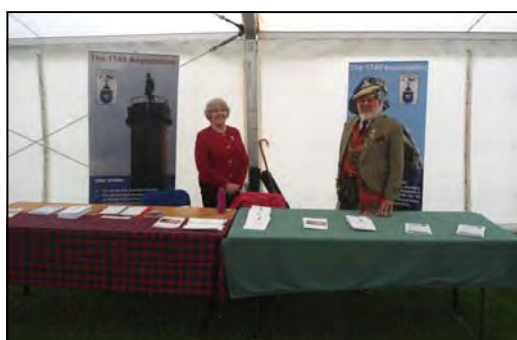
The 1745 Association