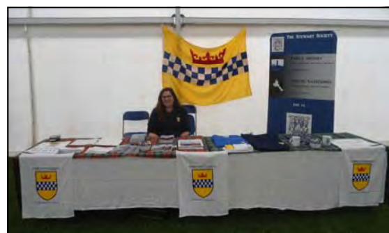
The Stewart Society