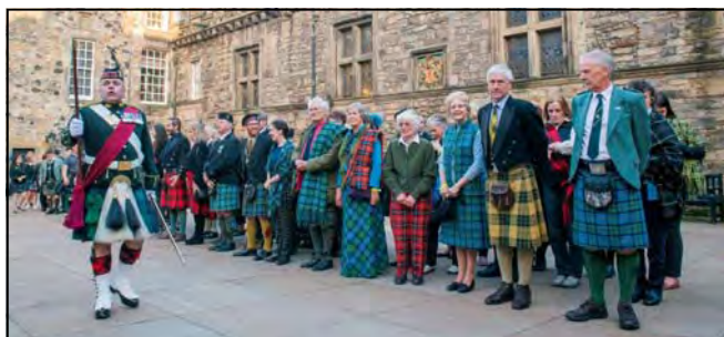
The Regimental Sergeant-Major gives the MacLeods and MacKenzies their marching orders

Credit must also be given to the rest of the personnel who helped make it possible, and as ever with military events the non-commissioned officers played a key role in putting into effect the plans made by the top-brass. In this case we will all remember the Sergeant-Major who tried to get us into some sort of order before marching onto the Esplanade—kidding us that there wouldn’t be many people there that early to see us. There were of course thousands.