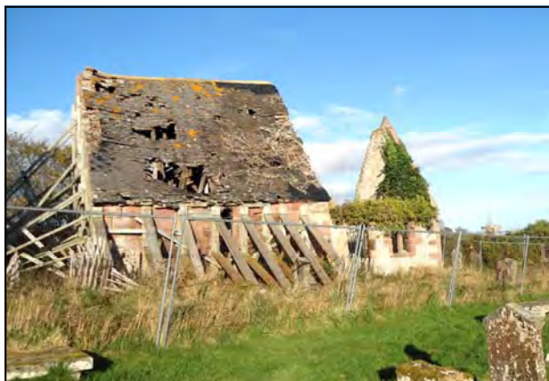
Kirkmichael: Prior to Building Work