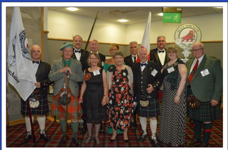
Carrickfergus, Northern Ireland 2017