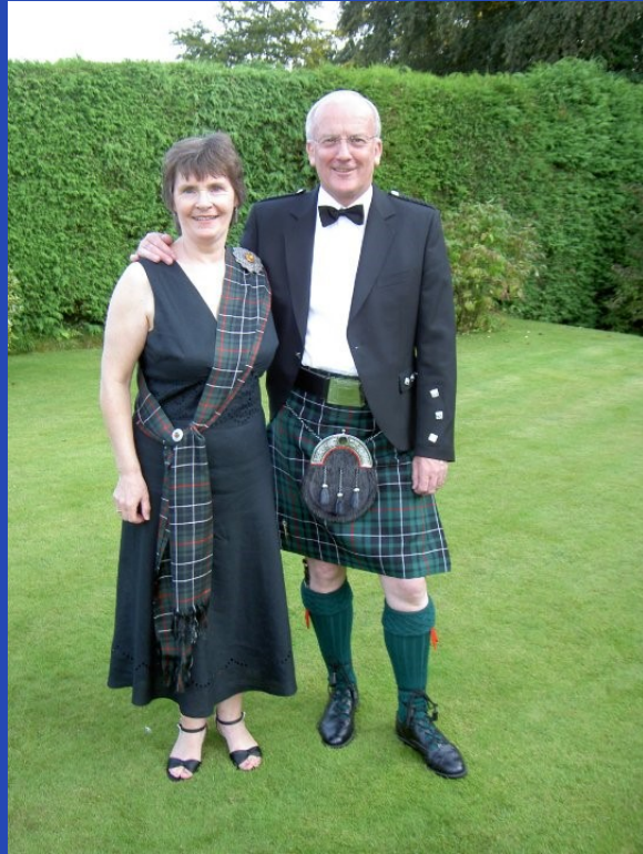
July 2004 we had our Annual Clan Gathering in Rhu, Helensburgh, Near the old Ardencaple Castle.