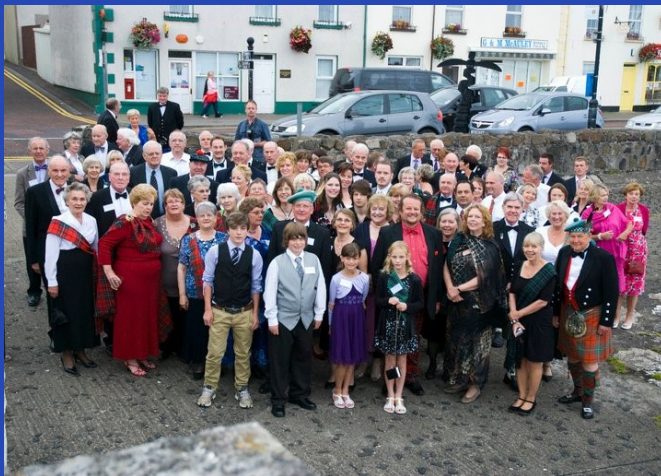
Carnlough, Northern Ireland 2011