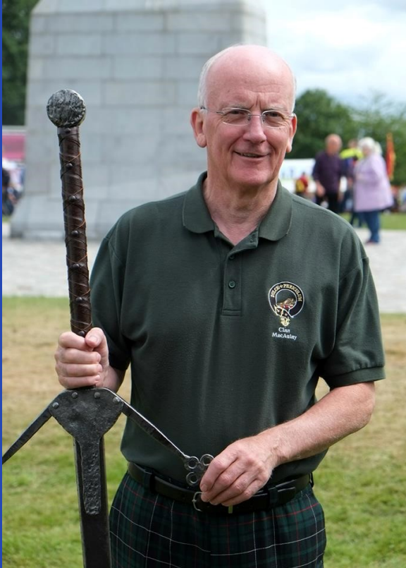
Bannockburn Live! 2014