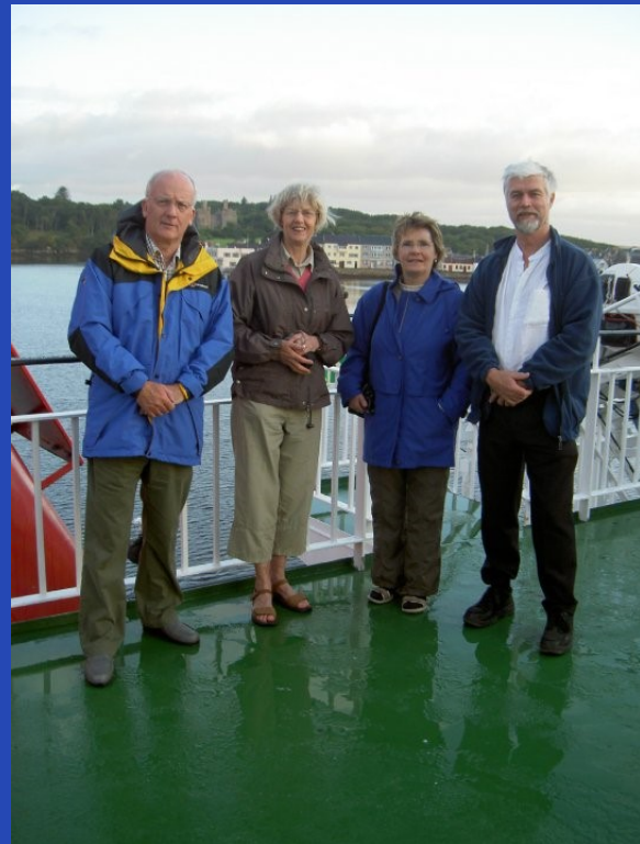
Isle of Lewis Gathering 2006