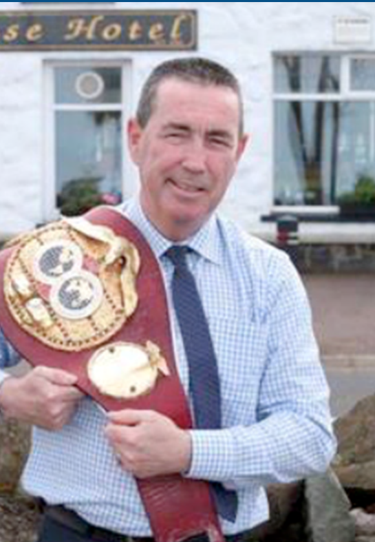
Dave 'Boy' McAuley with his world IBF title belt