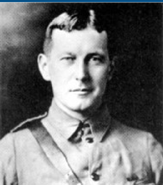
John McCrae, circa 1914.