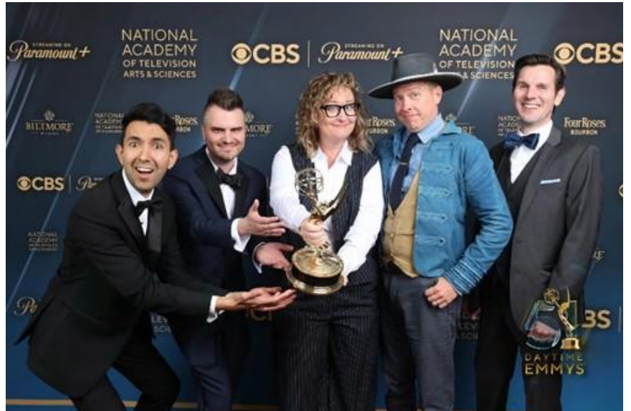
Re-use of image with the permission of the artists