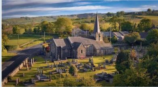
St. Patrick's Church and Graveyard