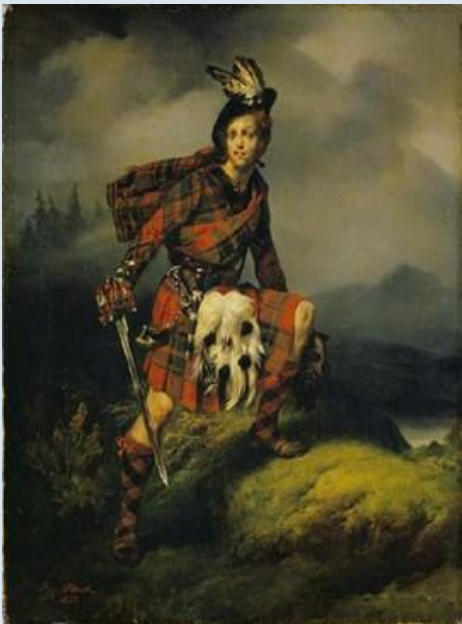
Allan M'Aulay by Horace Vernet, 1823